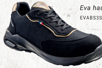
Eva haut noir S3S EVABS3SNR